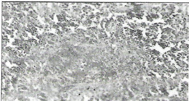
Fig1: Red pulp of spleen showing mild congestion with dilated sinusoids and mild hyperplasia of lymphoid follicle.

heamosidrin-laden macrophages are present. Extra cellular golden brown pigment is also seen. The spleen of mice of corresponding control groups does not show any changes from normal architecture.