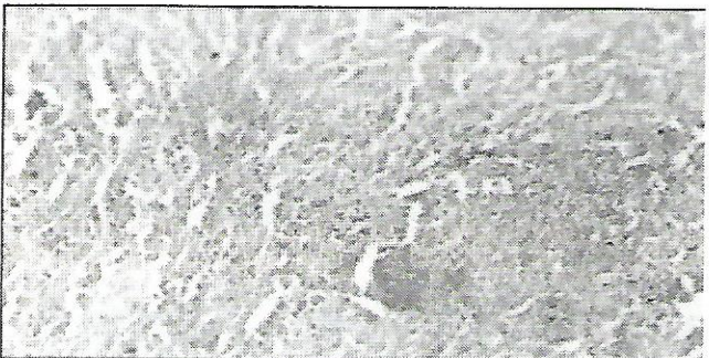
Fig: 2: Red pulp of spleen showing heamosidrin laden macrophages, dilated sinusoids with prominent reticuloendothelial cell lining and hyperplasia of lymphoid follicle.