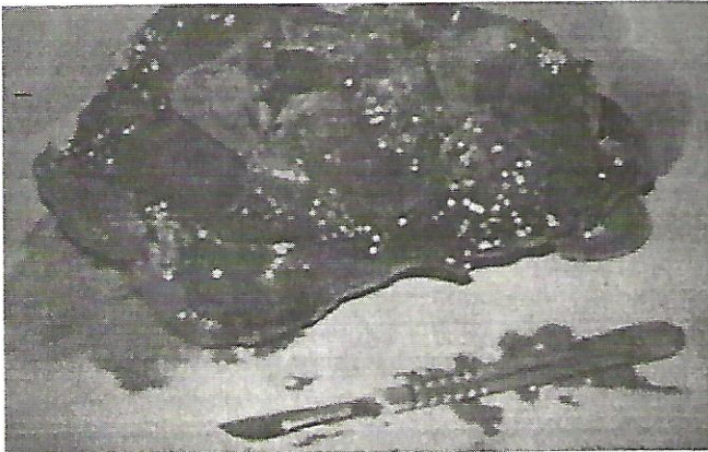
Figure 1: Gross Appearance

She was kept in ICU for two days but remained hemodynamically stable and afebrile with good urine output. On 5 th post op day (7 th post op day after her first laparotomy), she was discharge with instructions for follow up. She has since then turned up for regular follow up and is doing well six months after the excision of tumor with no signs of recurrence on serial ultrasonography. She has however refused any further treatment.