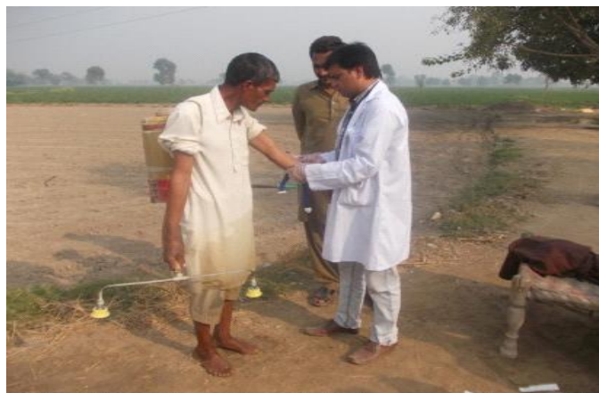
Figure 3 – 4: Interviews and physical examination of male farm workers and collection of Blood sample from a sprayer (all of farm workers are without any protective measures e.g. hand gloves, face, eyes, nose or mouth mask).