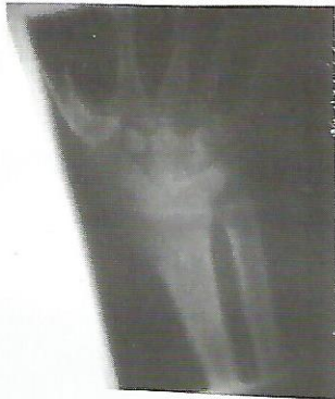
Fig. 3. Postoperative x-ray showing excision of trapezium.

Painful arthritis of first carpometacarpal joint is a disabling problem. Since this joint supports the thumb mobility hence disability of the joint affects the movements of thumb. Most of the patients spend their time with conservative management without any advantage. In severe cases, even the routine daily function like writing, holding spoon etc., are also affected badly. Surgery is indicated in such cases when pain could not be relieved with conservative management including splintage and intraarticular steroid injections. Our results show that surgery gives good results. Both the soft tissues and artificial implants are being used. Recognition of silicone particulate synovitis has favoured the trend more towards soft tissue arthroplasty procedures. The bony geometry of the joint does not provide full stability to the joint. Maximum stability is provided by the soft ligamentous structures of the joint. Our technique involves removal of the diseased bony articular structures with ligamentous support to the joint without restriction of joint mobility. In our surgical technique we have modified Burton and Pellegrini method.