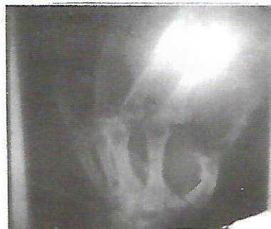
Fig 1: Preoperative x-ray showing severe arthritis of 1 st CMC joint with subluxation of joint

ranges from 10 to 16 kilograms. Postoperatively it increases from 18 to 25 kilograms. Preoperative pinch strength ranges from 2Kg to 2.8 Kg. It increased postoperatively from 3.5kilograms to 5kgs. On examination, no patient had hypersensitivity of scar. All patients except one had complete relief of pain. Only on patients complained of mild discomfort on strong pinch compression. All patients were satisfied as far as common daily routine work is concerned especially combining of hair, writing, eating, opening jars and doors etc. Only one patient suffered from mild reflex sympathetic dystrophy. However, this patient recovered fully after a supervised extensive hand physiotherapy program. There was no scapho-metacarpal impingement