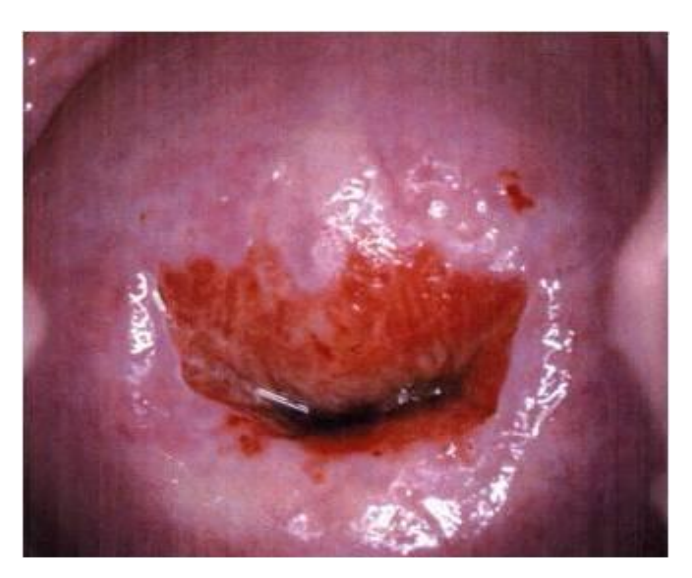
Fig. 2: Colposcopy view of squamocolumnar junction.

Pap smear (83.3%), which was statistically significant. However, the specificity of Pap smear was more (97%) than that of VIA (90%). The PPV of cytology was 83.3% versus 62.5% for VIA. The NPV of VIA was 98.8% versus 97% for cytology. The two-tailed P value of NPV equals 0.5 indicating that the association between two groups is considered to be not statistically significant.