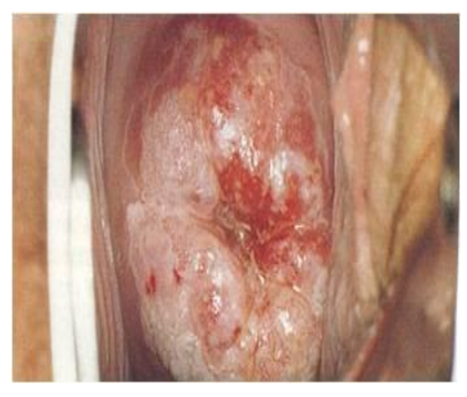
Fig. 3: Colposcopy view of acetowhite changes in cervix.