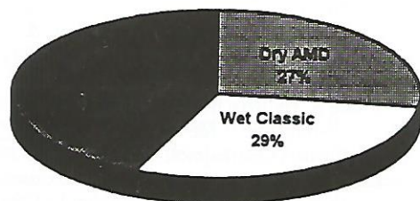
Fig. 2 Location of AMD