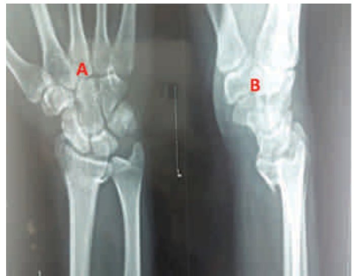
Figure 2: Preoperative X-ray of a case of Mehara type I Volar Barton fracture of left distal radius; A. AP view and B. lateral view