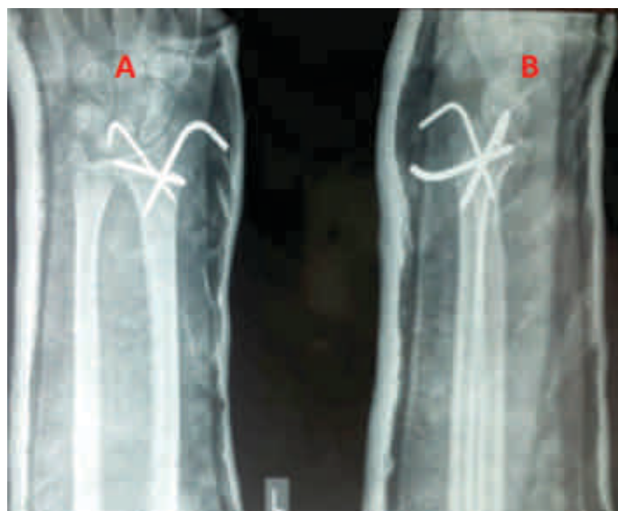
Figure 3: Postoperative X-ray of the same case fixed with Faisal Technique and augmented by cross K-wires and short arm cast. A: AP view and B: lateral view

There was 12.5% (1) case with excellent and 87.5% (7) with good result in Mehara type I fracture while 50% (1) had excellent and 50% (1) had good result in type II fracture. Overall, we had 20% (2) cases with excellent