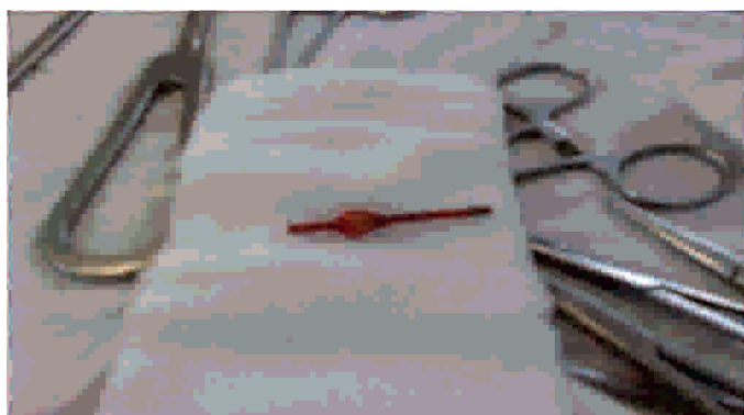
Figure 2: Matchstick with encrusted stone in its centre.