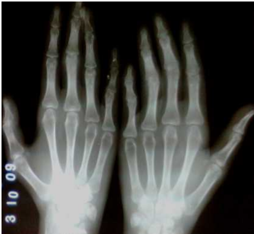
Fig 2: Frontal radiograph both hands demonstrates periarticular osteopenia with soft tissue swelling and reduced joint spaces along the proximal interphalangeal joints. Swan neck deformity is present at the 4 th finger of right hand and boutonniere deformity at 5 th finger of right hand and 3 rd , 4 th and 5 th fingers of left hand.