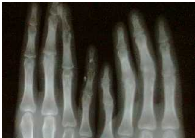
Fig. 3: A closer view of figure 2.