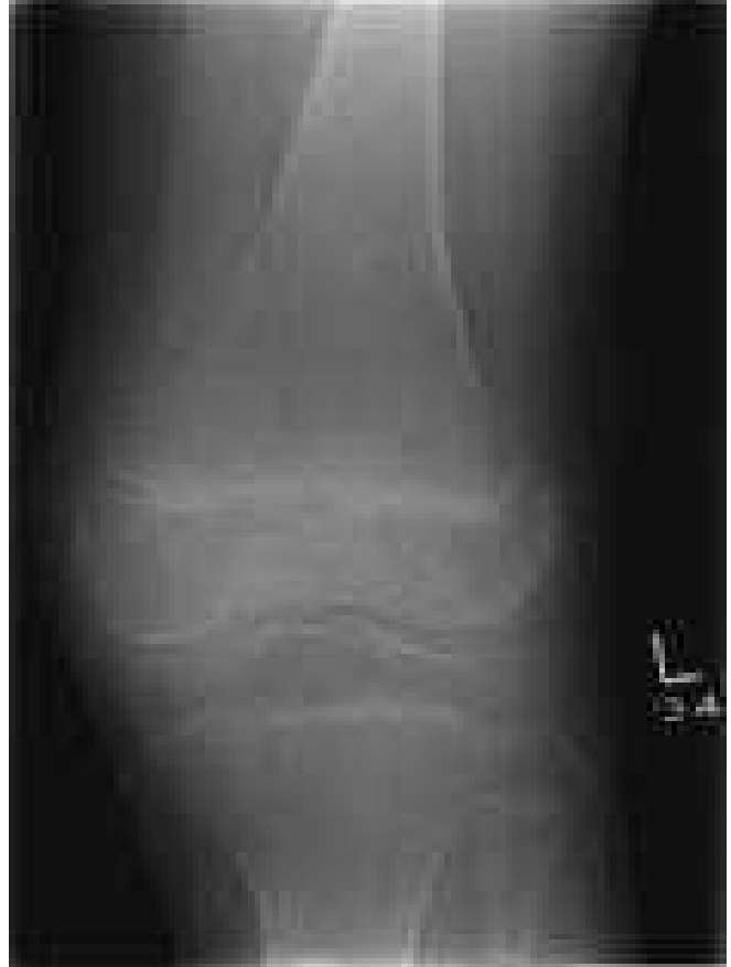
Fig. 1: Frontal radiograph left knee joint of a 14 years old female demonstrates juxta articular osteopenia with large square shaped epiphysis of distal femur and widened inter condylar notch. Joint space is reduced.