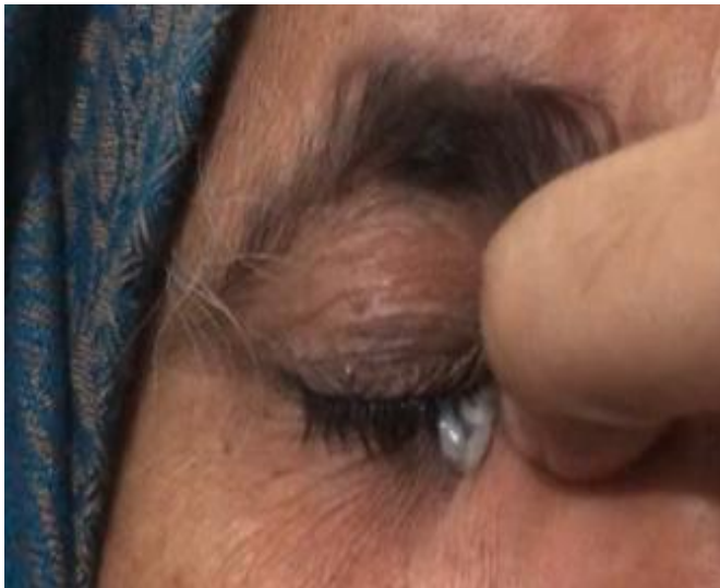
Figure 1: Positive regurgitation test