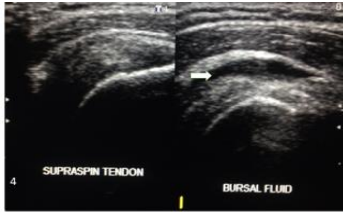
Figure 4. Fluid in the SASD bursa in a 45 year old male

The findings of Okoroha et al 12 are consistent with findings of our study. Matthieu et al 13 showed 65% specificity for USG which is low as compared to our study. Roy et al. 14-17 reported 91% sensitivity and 86% specificity for USG. For USG, the finding of his study