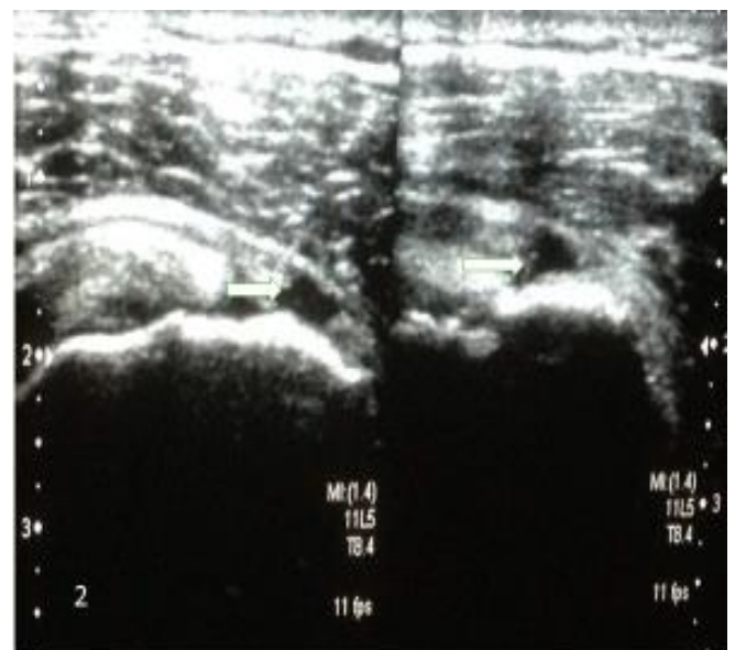
Figure 2 . Full thickness tear of supraspinatus tendon without retraction in a 54 year old male