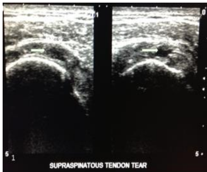
Figure 1. Partial thickness tear of SST in a 48 year old female