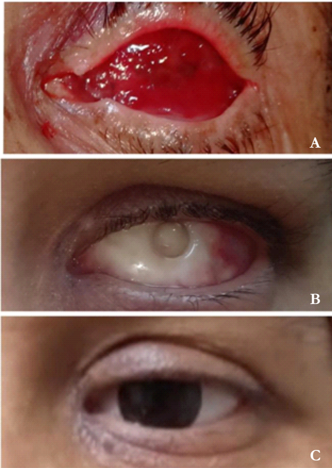
Figure 2 (A, B, C): Pre and post-operative pictures showing anophthalmic contracted socket, conformer in the newly formed fornix and ocular prosthesis in place with good aesthetic outcome.