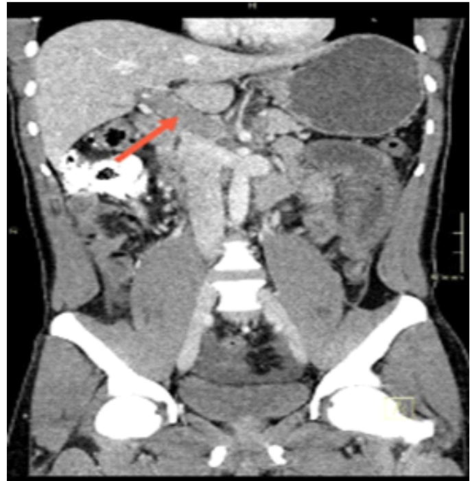
Figure 2: CT image showing portal vein thrombosis