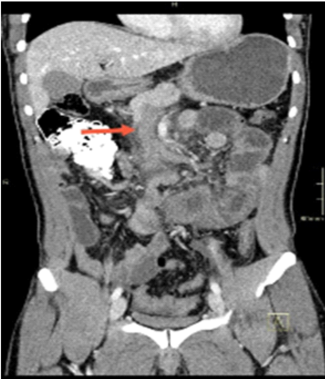
Figure 4: CT image showing superior mesenteric vein thrombosis

received and found to be positive. Favipiravir 1800 mg BID and then 800 mg BID and Dexamethasone 6 mg once a day though NGT were started. On 4 th day of admission NGT was removed and soft diet was started. On 5 th day, biochemical examination was repeated. PT was 13.6 seconds and INR was 1.16. CK was 115 U/L and WBC count was 12.7 \times 10^3/\mu\text{L} . Direct Bilirubin was 4.4 \mu\text{mol/L} . On 6 th day, patient was given normal diet. On 7 th day patient improved clinically and passed bowel. Analgesics were given only if needed. On 9 th day, patient was discharged from the hospital with Paracetamol as needed, Apixaban 5mg orally BID.