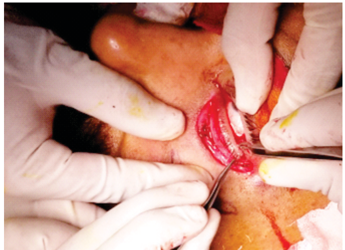
Figure 1b: Overlapping of Lid Margins to Assess Laxity of Lower Lid