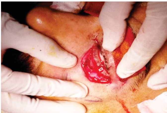
Figure 1c: Intra-operative View of Lower Lid after Excision of Excess Margins