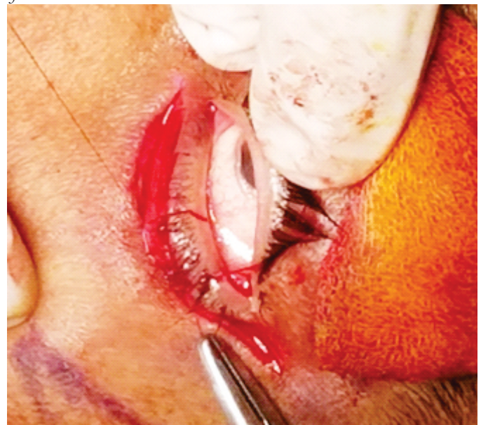
Figure 1d: Wound Closure in Layers