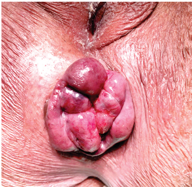
Figure 1.2: Grade-IV haemorrhoids before RAR

The sample population was given intravenous