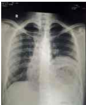
Figure 1: Preop CXR showing eventration of left diaphragm

Left BH is 80-90% more common than right sided hernia. This may be because the left pleuroperitoneal canal closes later than right side or it may be due to presence of liver on right side which occludes the foramen of Bochdalek (if present). 4