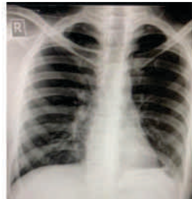
Figure 3: Post-Op CXR showing normal diaphragm

The hernia sac may contain colon (in half of the cases), small bowel, stomach, omentum and liver. 1 Our patient also had a spleen in his hernia which is an uncommon finding. 3 Intra-operatively, left kidney was found in our patient's hernia sac which is extremely rare with it forming <5% of all causes of ectopic kidneys. 5