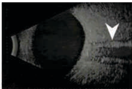
Figure 2: B-Scan. White Arrowhead Indicates Tram Track Sign