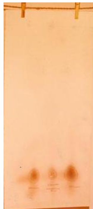
Fig. 2: Descending paper chromatogram of urine showing HGA spots- (from L to R), 1-Urine of the case detected 2- standard HGA solution and 3- urine of the elder sister of the case.

This documented study on inborn errors of metabolism gave the results of a thorough biochemical screening by means of well proved methods. The study shows that the problem of inborn errors of metabolism does exist in Pakistan and we need to know their nature and incidence by means of national survey. We cannot pick cases of any disease unless we are conscious of its existence and suspect it. The need of