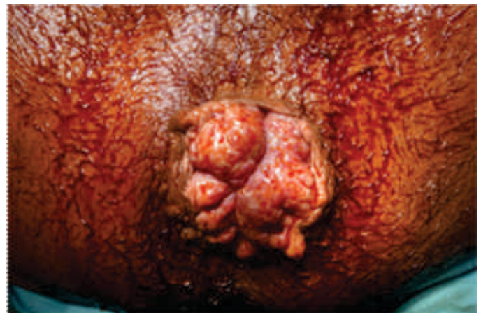
Figure 3: Grade-IV haemorrhoids after HAL and RAR

The collected data was entered in SPSS version 20.0 and analysed. Age is presented as a range and gender