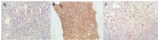
Figure 2: Histological Findings of Adrenal Biopsy

(A) Contrast-enhanced computed tomography (CT) of the adrenals showing bilateral masses (arrows) (B) Abdominal MRI coronal plane showing bilateral adrenal masses (arrows) (C) ^{18}\text{F} -fluorodeoxyglucose positron emission tomography showing the intensely hypermetabolic involvement in both enlarged adrenal glands (arrows). (D) ^{18}\text{F} -fluorodeoxyglucose positron emission tomography showing the involvement in left thyroid nodule (arrow).