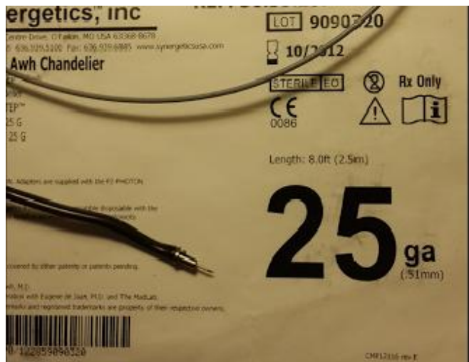
Fig. 1: The 25 gauge Awh Chandelier.

Out of fifteen patients, 13 (87%) had flat retinas postoperatively (Figure 2). Two patients had to undergo pars plana vitrectomy with silicone oil tamponade due to development of retinal detachment secondary to PVR at the 1 month follow-up visit.