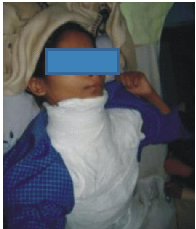
Fig. 5&6: X-ray Lumbosacral Spine (lateral view) showing Kyphus angle correction and patient with Plaster Jacket.