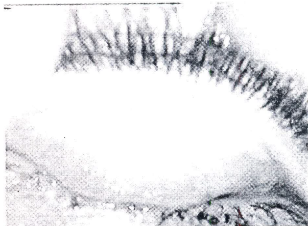
UPPER LID CONGESTION OF CONJUNCTIVA