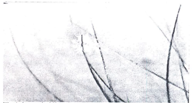
Fig.6: Louse holding the adjacent eye lashes