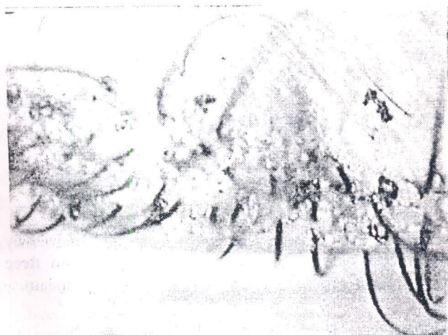
UPPER LID EYELASHES HUNDREDS OF NITS & MANY LICE ARE VISIBLE

She was advised to wash her eyelashes with soap and water and to apply ample amount of Polyfax eye ointment over the roots of lashes and within the eye in order to interfere with respiratory function of the lice, because other specific eye ointments against the lice e.g. Physostigmine, are not available in Pakistan.