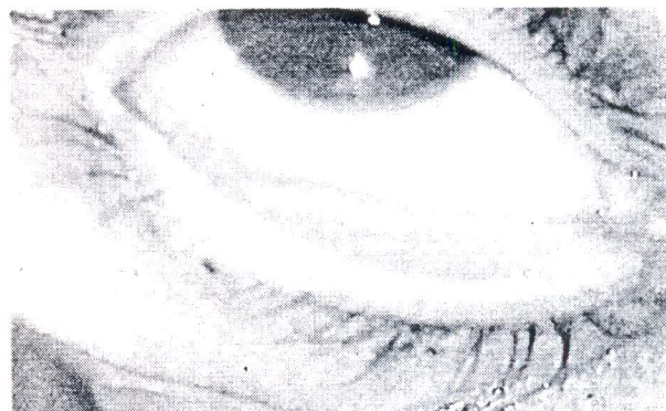
Fig.3: Lower lid conjunctival congestion

Third and fourth cases: Third and fourth case seen, were two children, a brother and a sister, ages 5 and 3 years, of middle socio-economic status and having good hygiene. Both children have involvement of both eyes and the presenting features were itching, redness, watering, and whitish deposits in the eyelashes. Their mother noticed the presence of lice in the eyelashes few weeks after they had a pet cat. Despite adequate washing with soap and water there was no improvement during the last two months. Examination of the eyelids revealed the presence of many lice and nits similar to those described earlier.